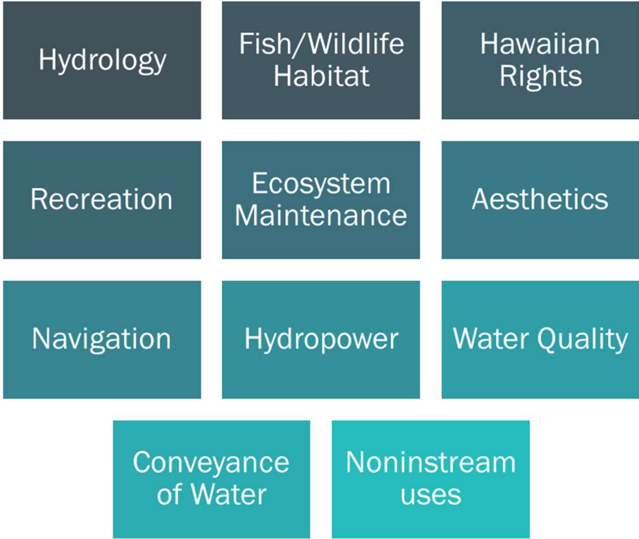
Figure 3: Phase 4-Phase Stream Restoration

The Phase 4 Stream Restoration Program will encompass components identified in Figure 3.