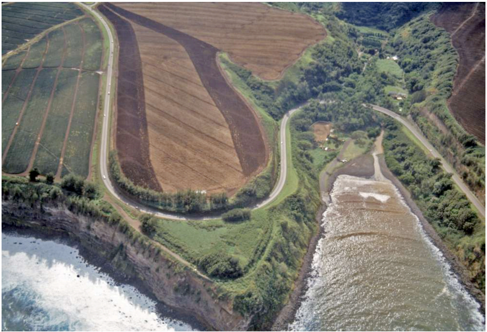
Māliko Gulch, Maui