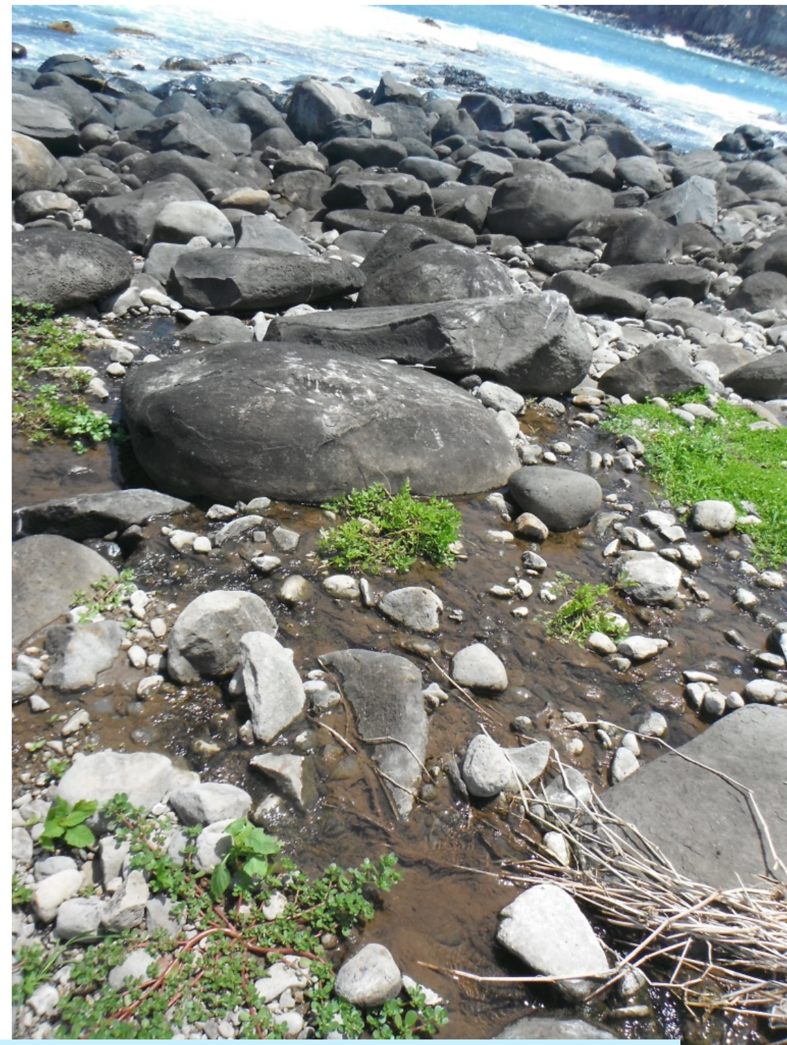
Kanemoeala stream- spring fed. (L-top) trail to stream (L- bottom) extensive limu beds in ocean off stream (R-top) stream meandering towards ocean