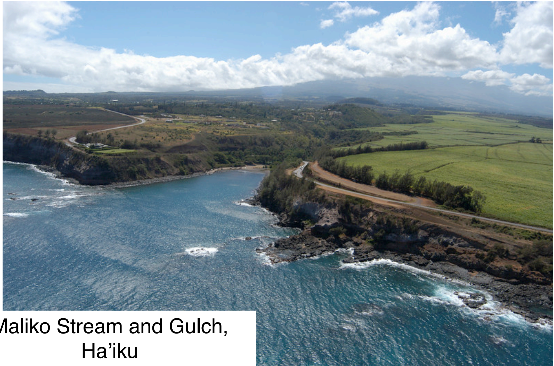
Maliko Stream and Gulch, Ha'iku