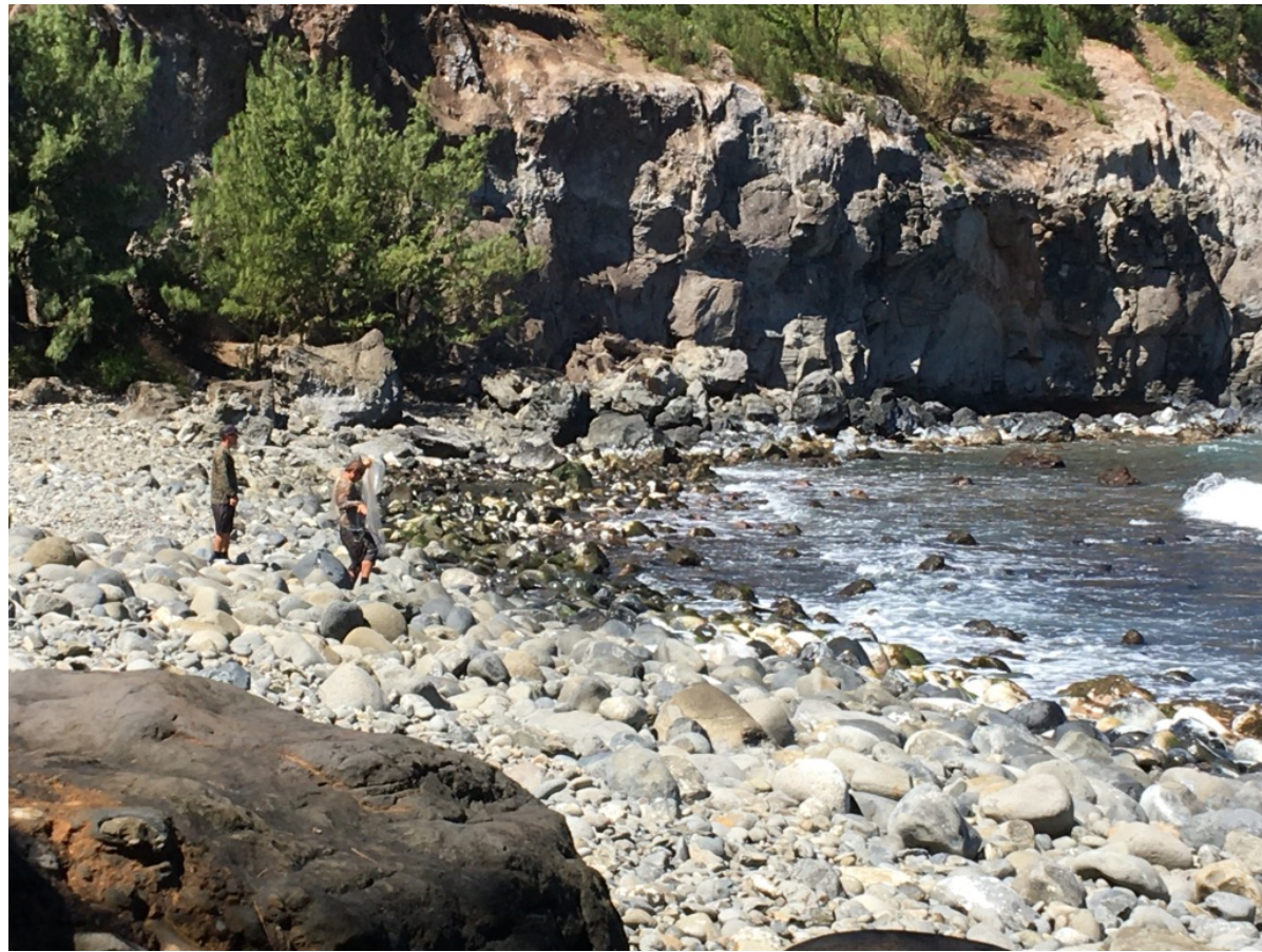
(L.-top) W. Kuiaha stream- small flow into ocean